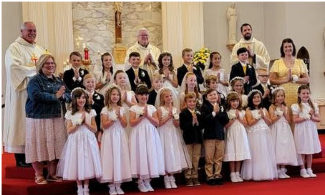
St. Raphael the Archangel Second Grade Class - First Communion 2023