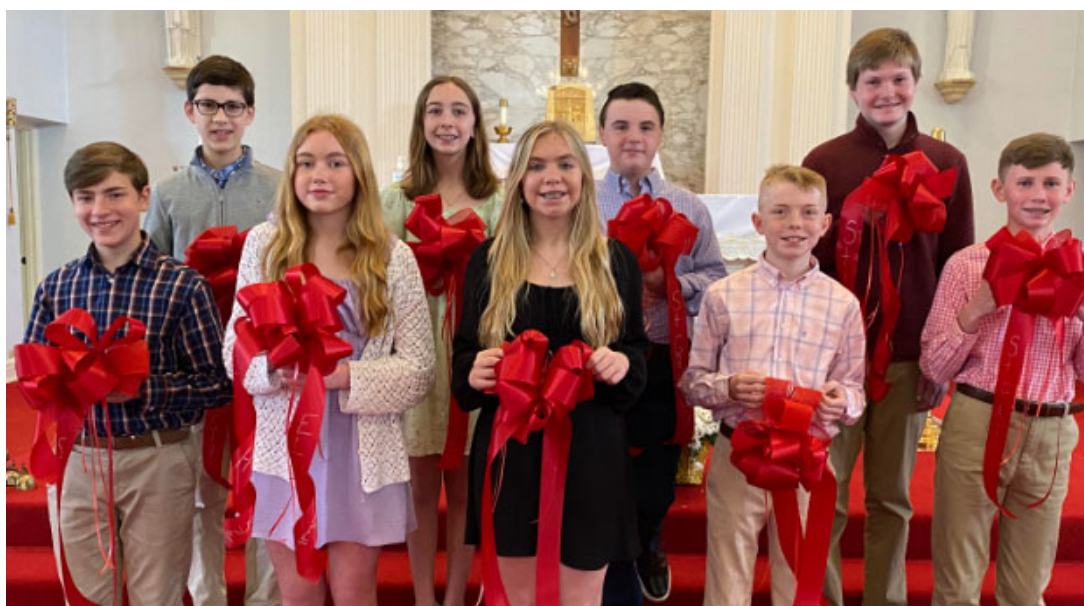
Our Confirmandi received their red bows at Mass last weekend.