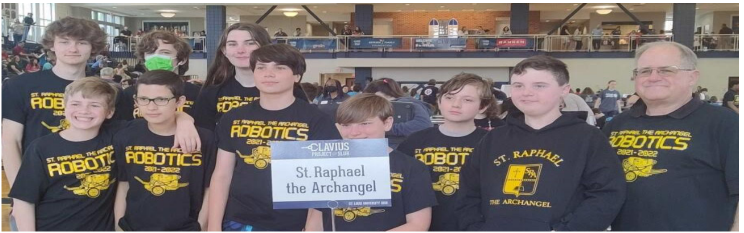
St. Raphael the Archangel participants in St. Louis University High School's Robotics Jamboree!