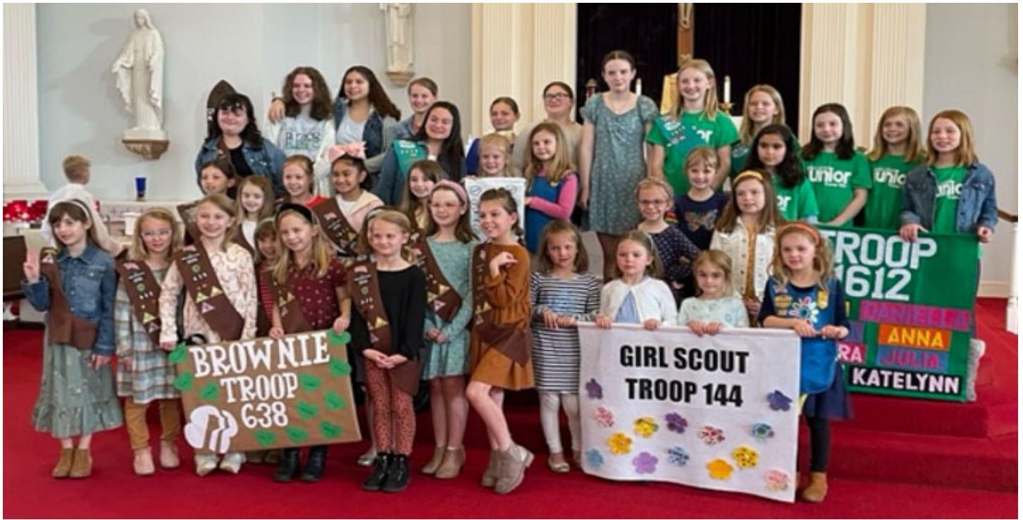
St. Raphael the Archangel Girl Scout and Brownie Troops celebrated Girl Scout Sunday on March 5, 2023!