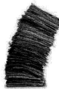
Need to get rid of sensitive documents?

Bring up to 2 standard files boxes to shred for free!