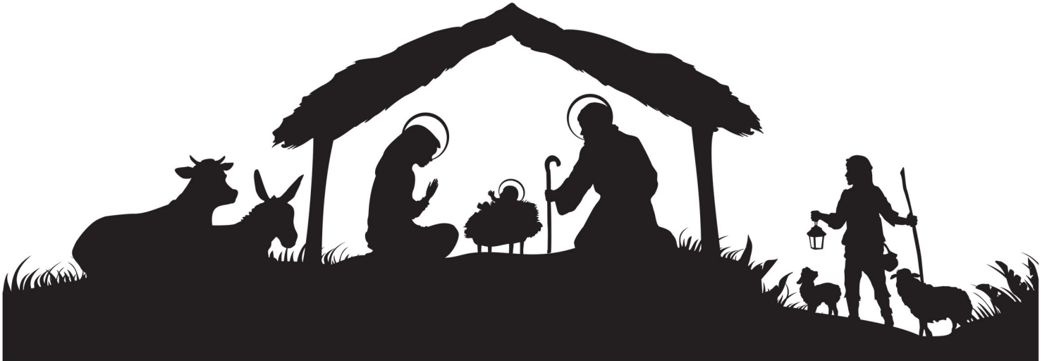
A Family Service for Blessing the Nativity Scene

The readings to be used will be announced at Mass as well as the appropriate page numbers of the readings in the Ritual Song (maroon book).