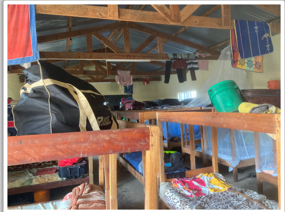
One of the Current "Dorms"