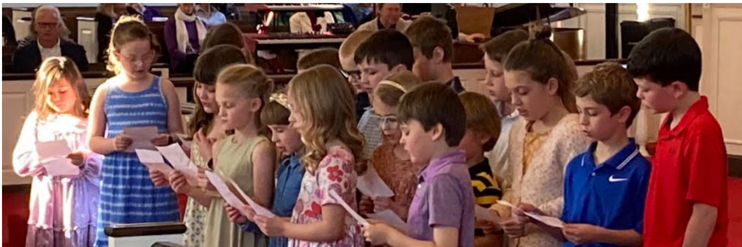
St. Raphael Second Graders lead everyone in prayer at the Family Mass held on Saturday, March 25, 2023!