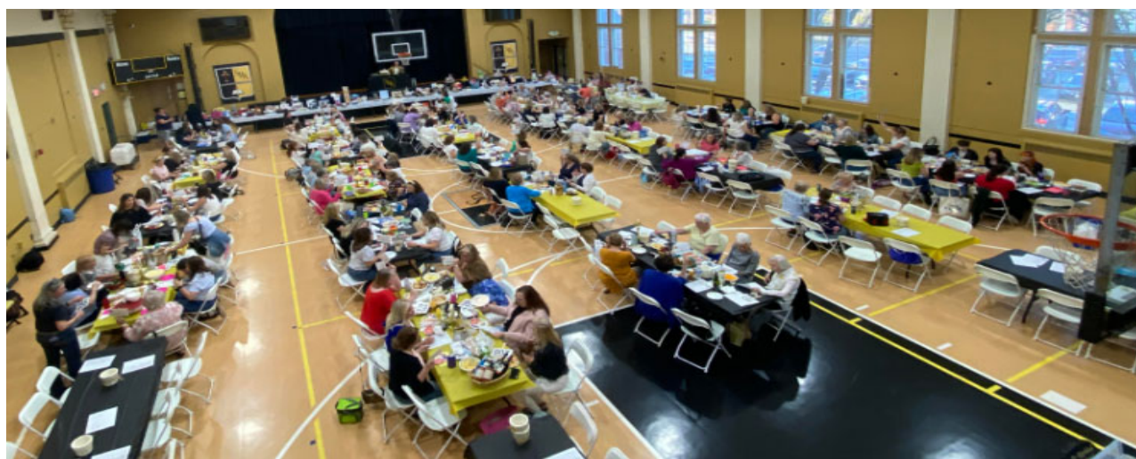
SRA Ladies' Club Quarter Auction