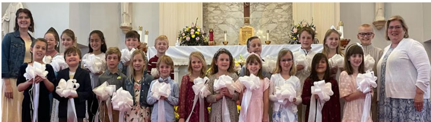
Second Grade Bow Sunday!