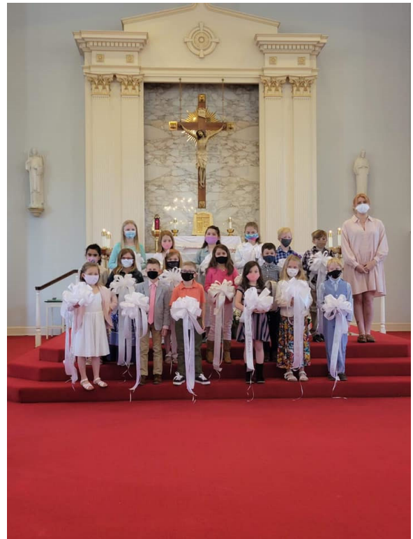
Second Graders Received Their First Communion Bows

Thank you for your generous support of the ACA!