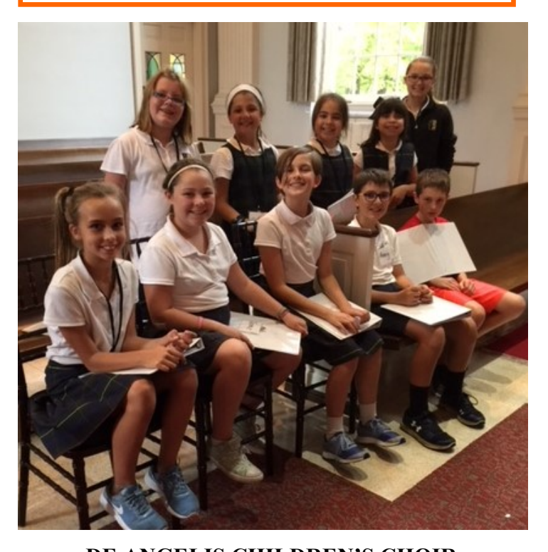
DE ANGELIS CHILDREN'S CHOIR The De Angelis Children's Choir will be singing on Saturday, October 21 at 4:30 pm Mass.

In addition, bring those books that are just sitting on your shelf needing a new home. We'll have a book swap and donate all unclaimed books to a local charity.