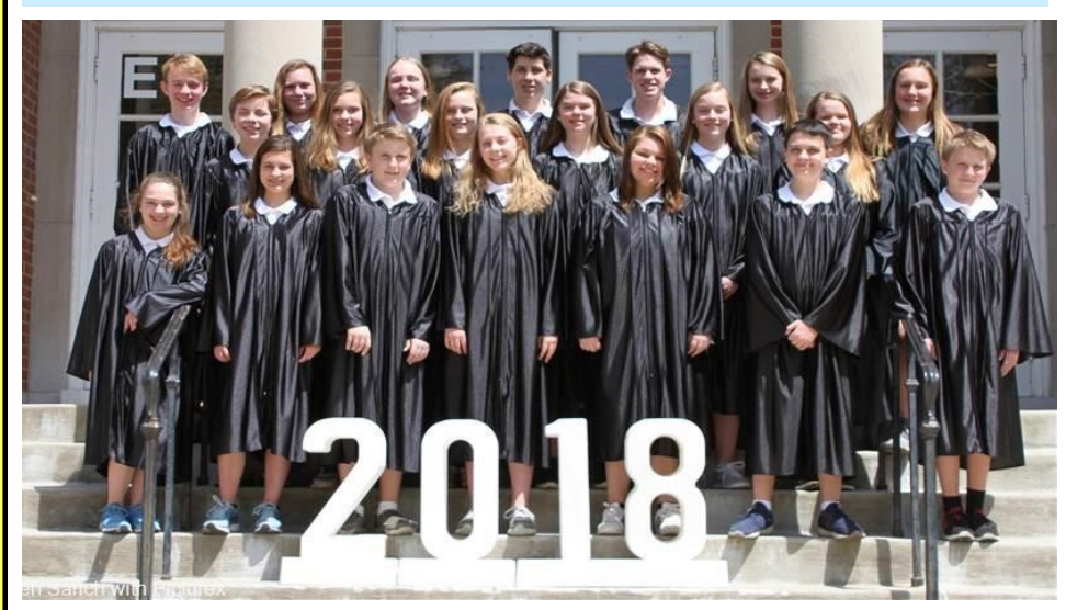
CONGRATULATIONS ST. RAPHAEL THE ARCHANGEL 2018 GRADUATES!

CATHOLIC CHURCH MAY 27, 2018 MOST HOLY TRINITY SUNDAY