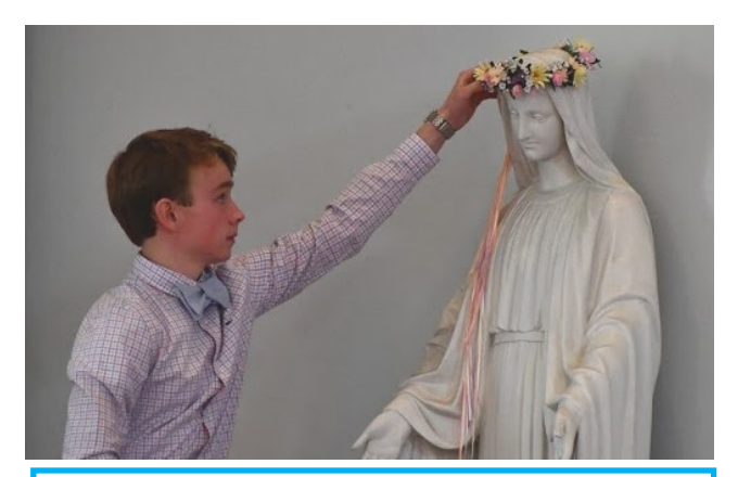
MAY CROWNING THURSDAY, MAY 3, 2018