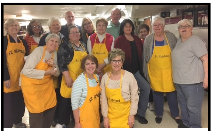
Dinner at Sts. Peter & Paul - Thank you!

Commissioning Service for Eucharistic Ministers will be at each Mass the weekend of March 18-19. Please plan to attend one of the Masses and come forward for this very meaningful blessing.