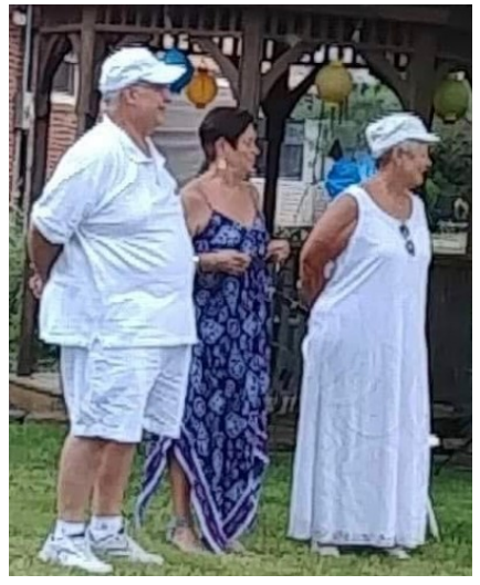
WICKET CLUB 2018