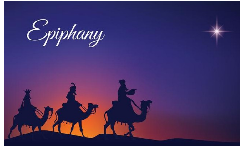
ding feast at Cana in Galilee."