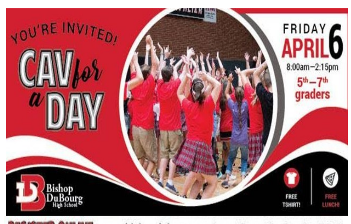
REGISTER ONLINE: www.bishopdubourg.org/apps/form/CavforaDay2018