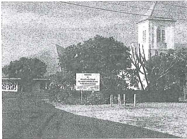
Modern Church and Rectory

Pictured here are three of the photos taken in Hawaii.