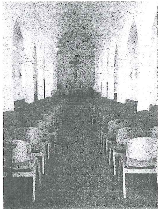
Interior of the Original Church