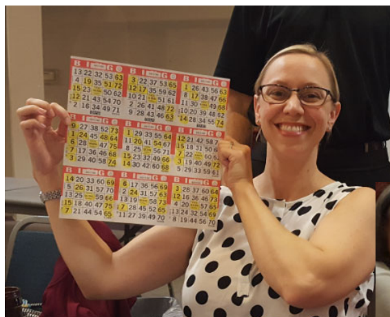
A Fun Time Was Had By All! SRA Ladies’ Club Bingo Night September 20 at Bandwagon Bingo Hall