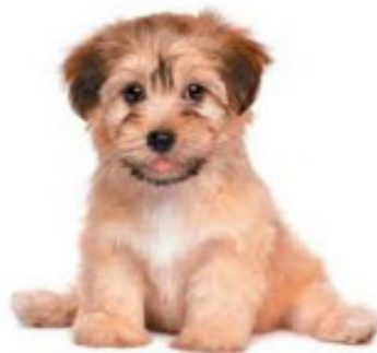
*example of Havanese puppy*