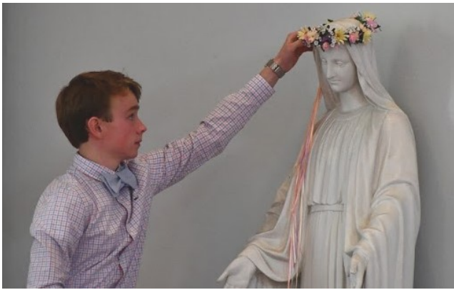
MAY CROWNING THURSDAY, MAY 3, 2018