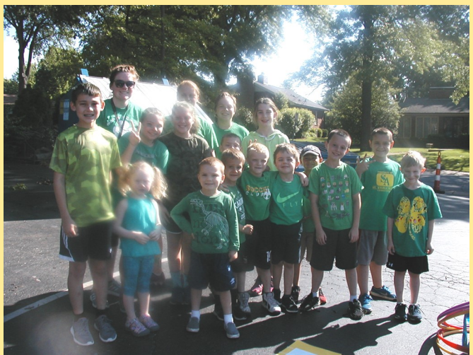
Field Day May 25, 2017