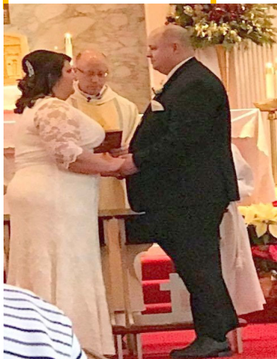
United in Christ