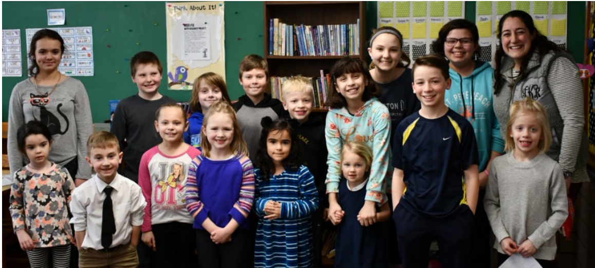
Winning group from Family Trivia!